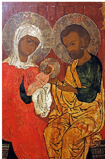
Photo: The Nativity of the Virgin (18 century), Russian icon | Credit: