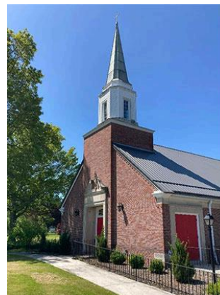
St. Francis in the Fields