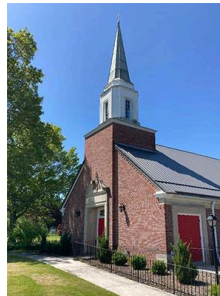
St. Francis in the Fields