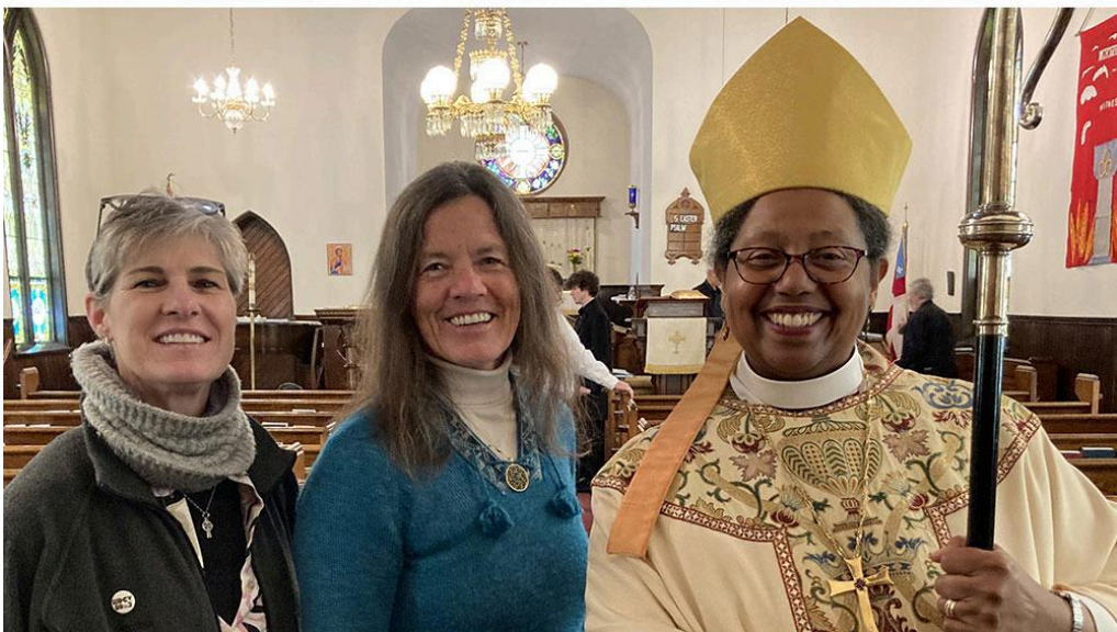
The folks at St. Peter's in Blairsville welcomed Bishop Ketlen by "striking up the band" on Sunday, April 21.

Easter Egg Hunt in Homewood Featured in Post-Gazette