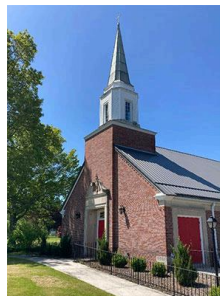
St. Francis in the Fields